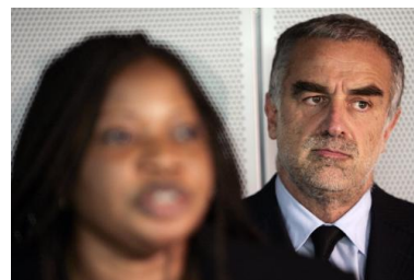
Luis Moreno Ocampo (à dr.), ancien procureur de la CPI, le 18 mars 2006. Au premier plan : Fatou Bensouda, l'actuelle procureure.

cabinet de l'époque, Silvia Fernández de Gurmendi [par la suite présidente de la CPI – ndlr] », dans les faits reprochés.