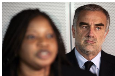
Luis Moreno Ocampo (à dr.), ancien procureur de la CPI, le 18 mars 2006. Au premier plan : Fatou Bensouda, l'actuelle procureure.