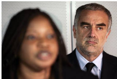
Luis Moreno Ocampo (à dr.), ancien procureur de la CPI, le 18 mars 2006. Au premier plan : Fatou Bensouda, l'actuelle procureure.