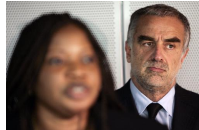
Luis Moreno Ocampo (à dr.), ancien procureur de la CPI, le 18 mars 2006. Au premier plan : Fatou Bensouda, l'actuelle procureure.

cabinet de l'époque, Silvia Fernández de Gurmendi [par la suite présidente de la CPI – ndlr] », dans les faits reprochés.