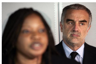
Luis Moreno Ocampo (à dr.), ancien procureur de la CPI, le 18 mars 2006. Au premier plan : Fatou Bensouda, l'actuelle procureure.